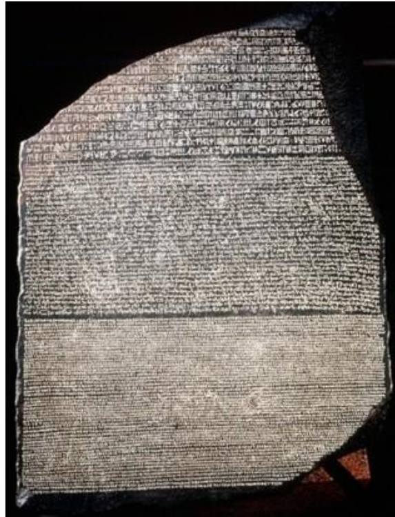
The Rosetta Stone