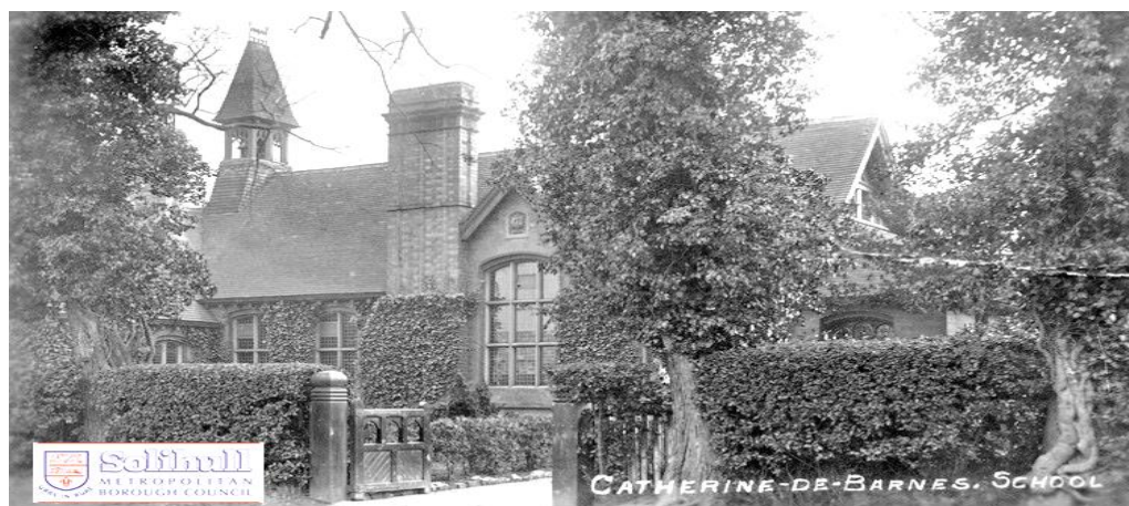
Catney Church and Village School c. 1910