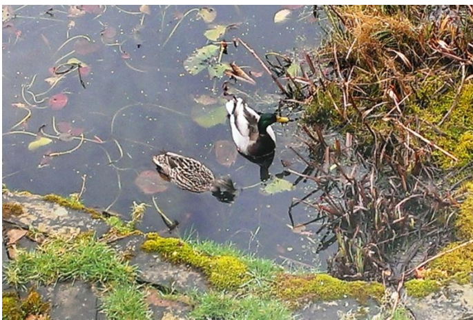
DUCKS HAVING A VISIT TO THE POND AT 97 HAMPTON LANE