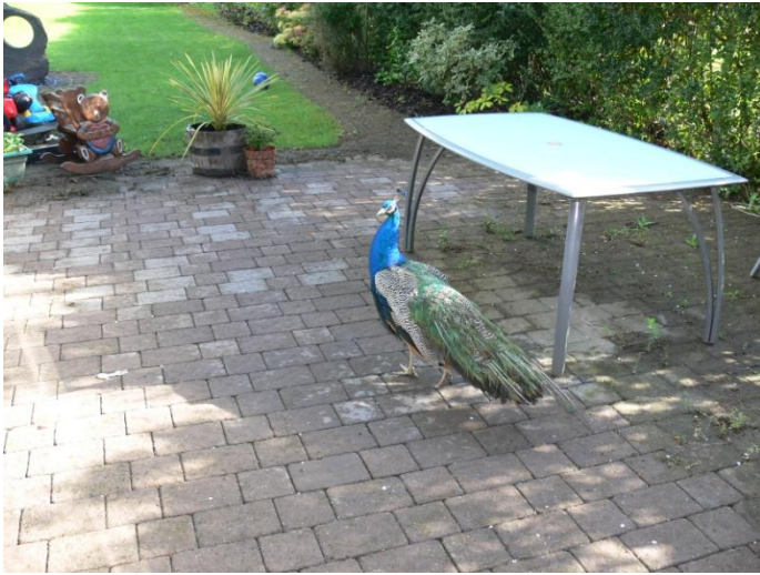
A PEACOCK IN THE GARDEN AT 61 HAMPTON LANE.